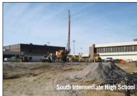
South Intermediate High School

for move-in during April, and the rest will be completed by August. And, after many months of construction, students and staff will return to Rhoades Elementary in August to find a new gym, cafeteria, kitchen and a renovated media center, music and art room.