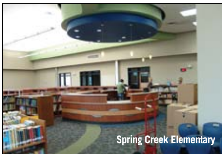
Spring Creek Elementary