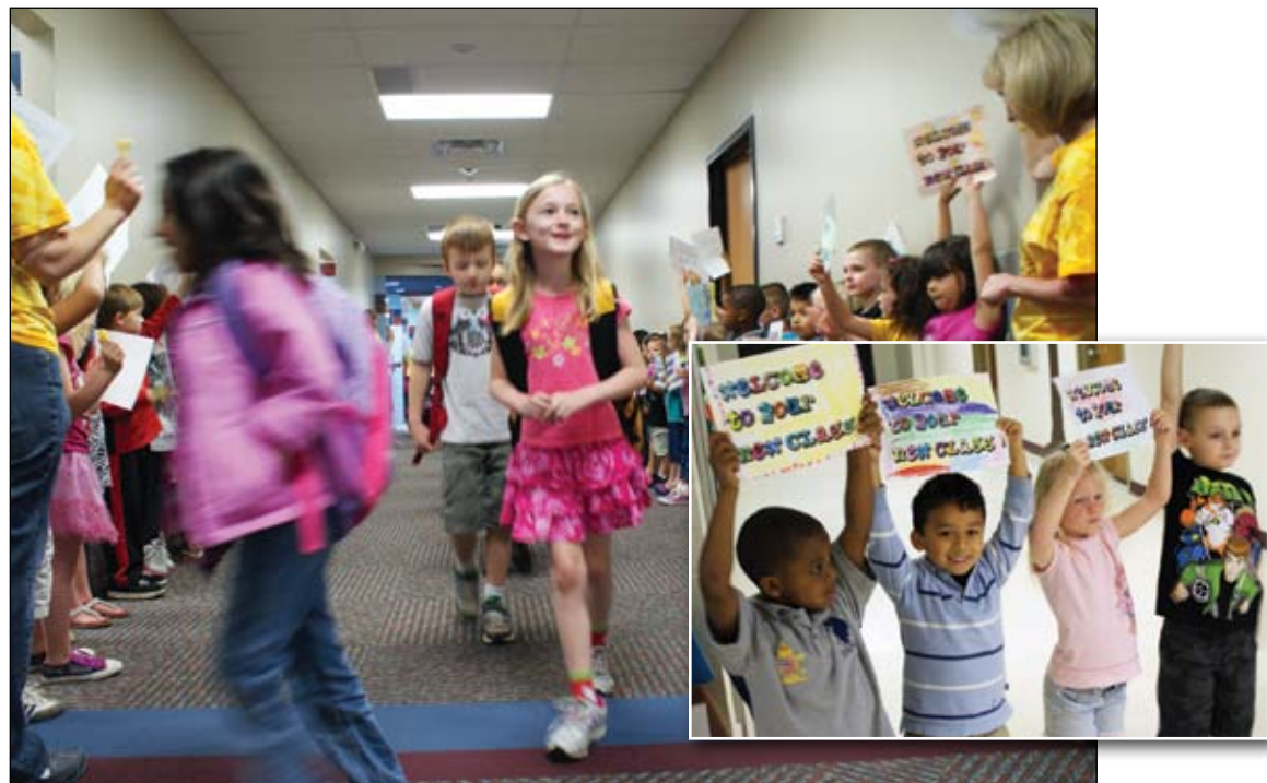
Students at Lynn Wood Elementary move into their newly-constructed wing complete with new classrooms and a Media Center. Inset, students welcome and cheer on the new arrivals with signs of congratulations.

Arrowhead, Spring Creek, and Leisure Park Elementaries have also opened and occupied new media centers and classroom spaces, and additional building remodels will take place throughout the summer. The work at these three sites will be complete in time for the new school year. At Vandever Elementary, new classrooms, a media center and a gymnasium are currently under construction, some of which will be ready