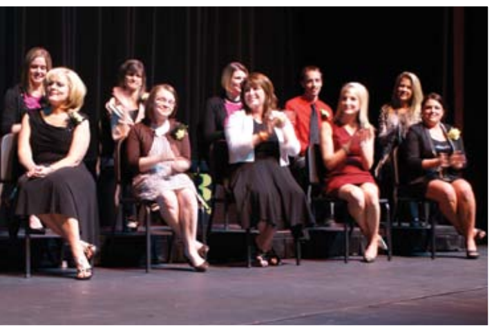
A first for the Teacher of the Year event, this year's pool of finalists was narrowed to the Top 11 site teachers instead of 10. Site finalists and their families and friends were honored before the ceremony with an elegant dinner in the Performing Arts Center grand lobby.